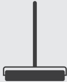
10-12mm Nap Roller *Do not use Microfibre

The following equipment is recommended for this application.